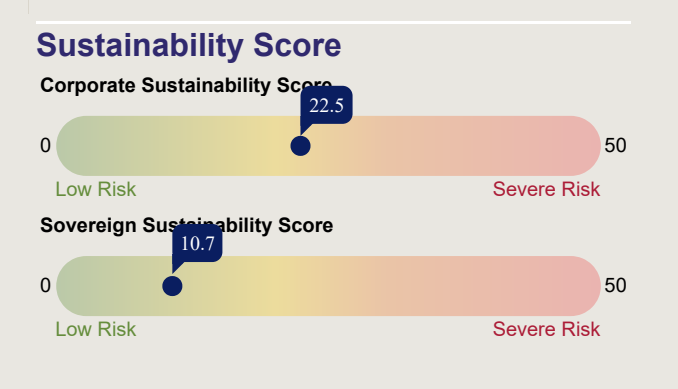
Sestante Dynamic Assertive